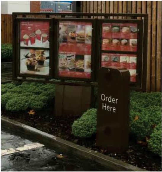
3 panel menu board and speaker post