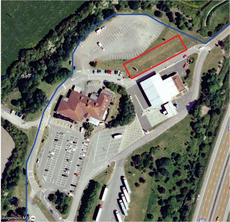
1 Satellite Overlay NTS